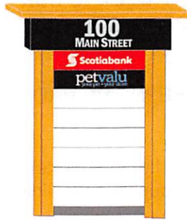
Example of Shopping Center Directory Signs

That this Bylaw comes into effect upon the date of its Third and Final Reading.